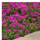
Homestead Hot Pink