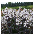
Onyx and Pearls