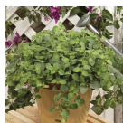
Hot and Spicy