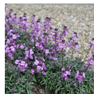
Bowles Me Away