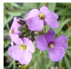
Bowles Me Away