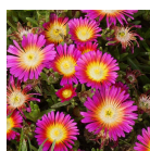
Hot Pink Wonder