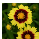
Yellow & Red