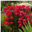
Red Riding Hood