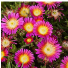
Hot Pink Wonder