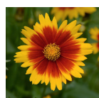
Gold & Bronze