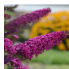
Queen of Hearts