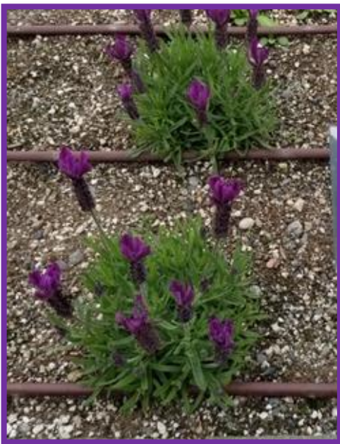
PNW June 3 rd Lin 50 planted wk 12