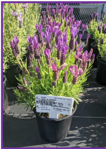
May 2020 California Lin 50 planted wk 10