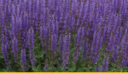
Salvia 'Blue by You'

Excellent performer in the landscape makes a big color impact. Winter hardy, too! Height: 10 to 12 in. (25 to 30 cm) Spread: 10 to 12 in. (25 to 30 cm) USDA Hardiness Zones: 5a to 8b