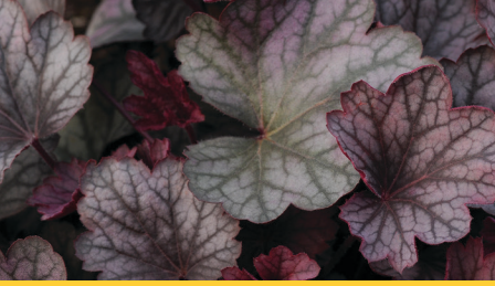
Heuchera 'Carnival Rose Granita'

Hybrid Coreopsis hold their shape and flower through the entire Summer with unique bicolor patterns. Height: 12 to 14 in. (30 to 36 cm) Spread: 12 to 14 in. (30 to 36 cm) USDA Hardiness Zones: 5a to 9b