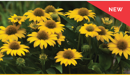
Echinacea Sombrero Poco™ Yellow

A new standout variety joins the lineup this year, NEW Sombrero Poco™ Yellow . This compact Echinacea offers the same exceptional Winter hardiness, excellent branching and proven landscape performance as the tried and true Sombrero® series. Plus, the unique non-fading flowers provide long-lasting enjoyment to the end consumer.