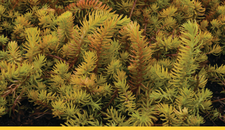
Sedum Prima Angelina

Offers repeat flowering throughout growing season with excellent heat tolerance and Winter hardiness. Height: 20 to 22 in. (51 to 56 cm) Spread: 18 to 22 in. (46 to 56 cm) USDA Hardiness Zones: 4b to 9a