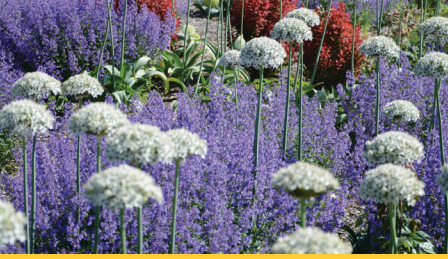
Nepeta Junior Walker™

Compact, Winter-hardy Echinacea with excellent branching and proven landscape performance. Height: 14 to 16 in. (36 to 41 cm) Spread: 14 to 16 in. (36 to 41 cm) USDA Hardiness Zones: 4b to 9b