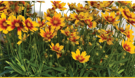
Coreopsis UpTick™ Gold & Bronze

For more information on our outstanding varieties, visit darwinperennials.com .