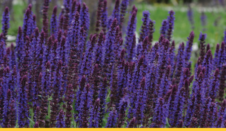
Salvia Lyrical™ Blues

Abundant flowers on a compact habit. Trialed and proven to be more floriferous than other Nepeta. Height: 18 in. (46 cm) Spread: 30 in. (76 cm) USDA Hardiness Zones: 5a to 8b