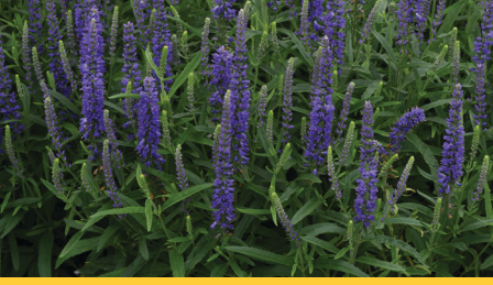
Veronica Moody Blues® Dark Blue

Robust, well-branched plant delivers more flower power than the average Salvia nemorosa . Height: 22 to 24 in. (56 to 61 cm) Spread: 22 to 24 in. (56 to 61 cm) USDA Hardiness Zones: 4a to 9b