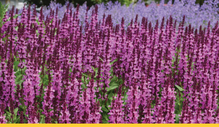
Salvia 'Rose Marvel'

Unique, interlacing branches prevent breakage during heavy rainfall. Height: 16 to 18 in. (41 to 46 cm) Spread: 14 to 16 in. (36 to 41 cm) USDA Hardiness Zones: 4a to 9b