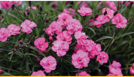
Dianthus Mountain Frost™ Pink PomPom

Largest flowers of any rose-colored Salvia nemorosa on the market – for big impact in the landscape. Height: 10 to 12 in. (25 to 30 cm) Spread: 10 to 12 in. (25 to 30 cm) USDA Hardiness Zones: 4a to 9b