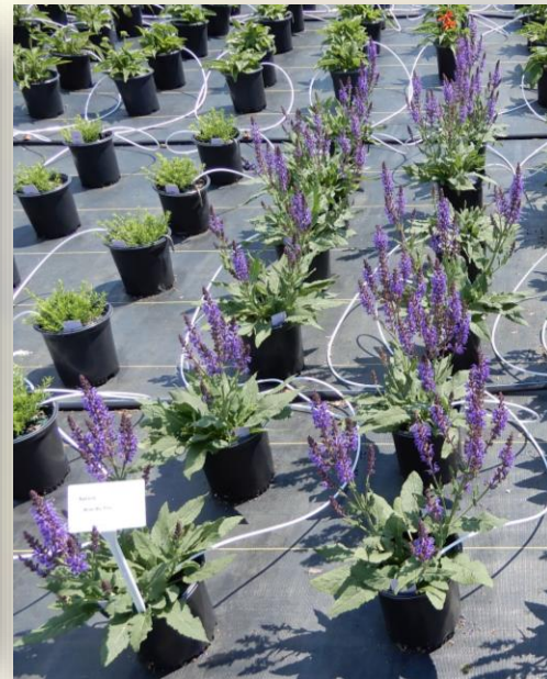
Group 3 Planted: wk 20 Photo: wk 26 (6.28.19)