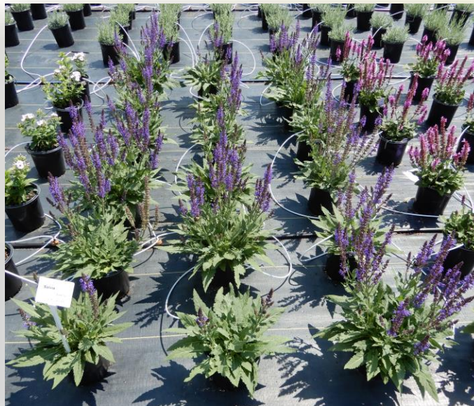
Group 2 Planted: wk 17 Photo: wk 26 (6.28.19)