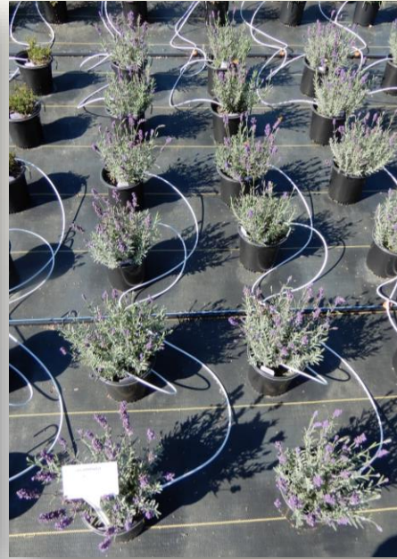
Group 4 Planted: wk 25 Photo: wk 34 (8.23.19)