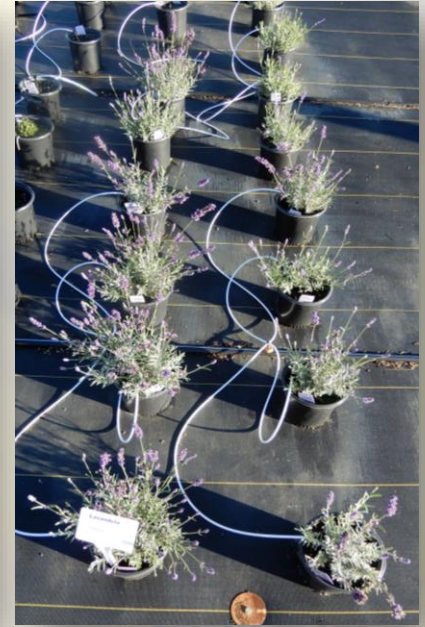
Group 5 Planted: wk 28 Photo: wk 40 (10.4.19)