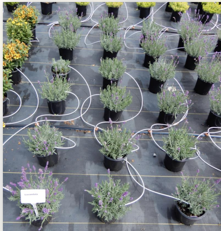
Group 2 Planted: wk 17 Photo: wk 29 (7.18.19)