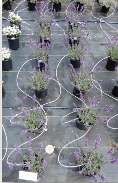
Group 3 Planted: wk 20 Photo: wk 29 (7.18.19)