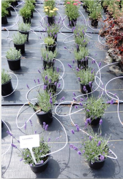
Group 1 Planted: wk 11 Photo: wk 23 (6.7.19)