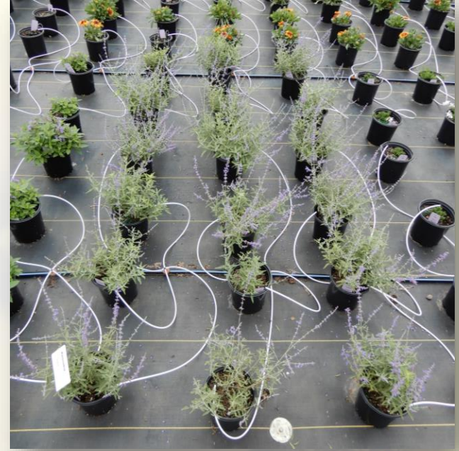
Group 5 Planted: wk 28 Photo: wk 37 (9.13.19)