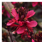
Dark Pink 24