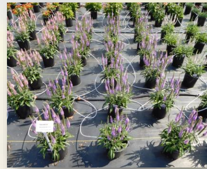
Mauve Imp Photo: wk 28