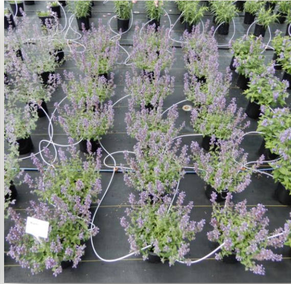
Group 2 Planted: wk 17 Photo: wk 25 (6.20.19)