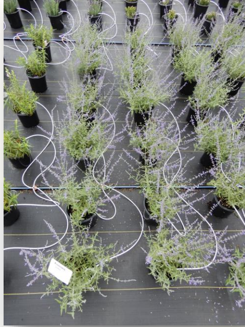
Group 4 Planted: wk 25 Photo: wk 33 (8.14.19)