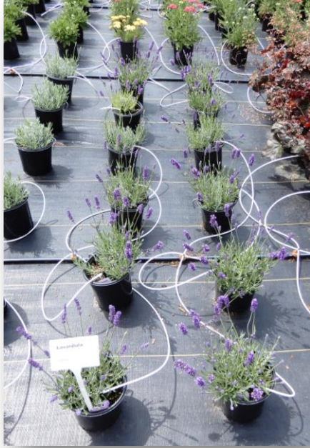
Group 1 Planted: wk 11 Photo: wk 23 (6.7.19)