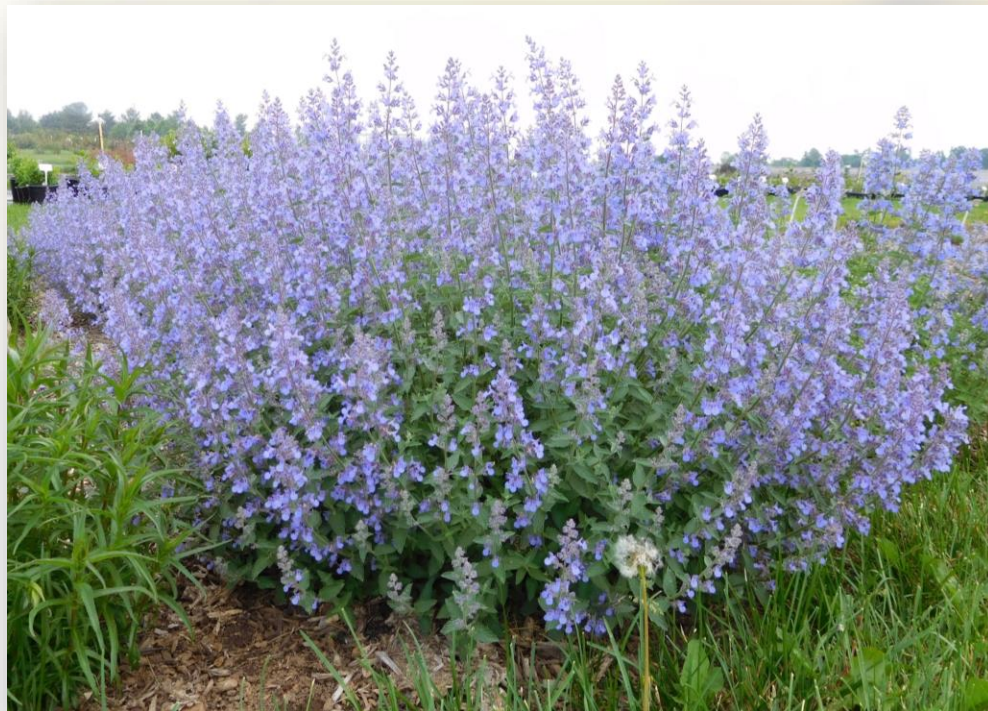
Overwintered in PA trials Photo: 5.27.16