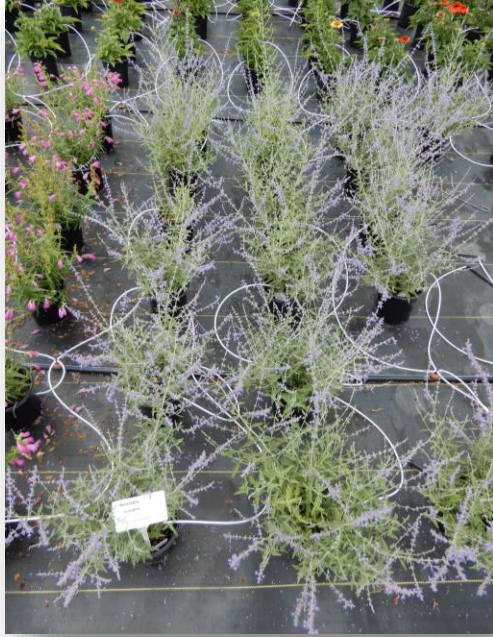
Group 3 Planted: wk 20 Photo: wk 29 (7.18.19)