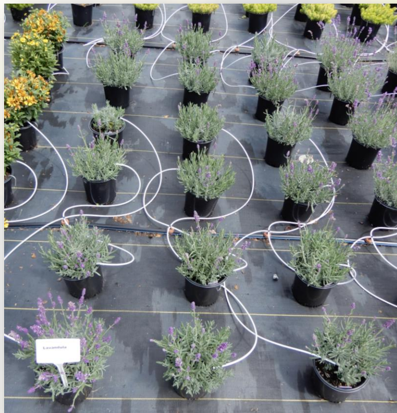
Group 2 Planted: wk 17 Photo: wk 29 (7.18.19)