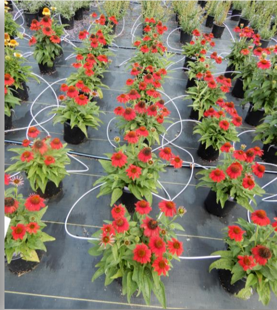
Group 3 Planted: wk 20 Photo: wk 31 (8.2.19)