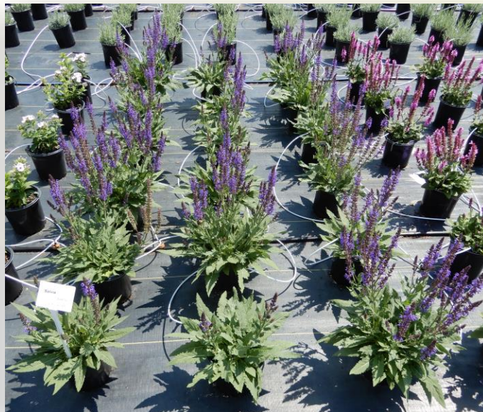
Group 2 Planted: wk 17 Photo: wk 26 (6.28.19)