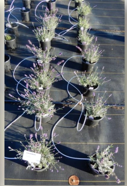
Group 5 Planted: wk 28 Photo: wk 40 (10.4.19)