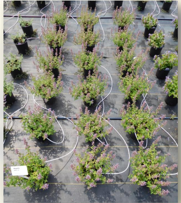
Group 4 Planted: wk 25 Photo: wk 31 (8.2.19)