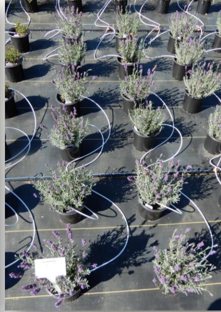
Group 4 Planted: wk 25 Photo: wk 34 (8.23.19)