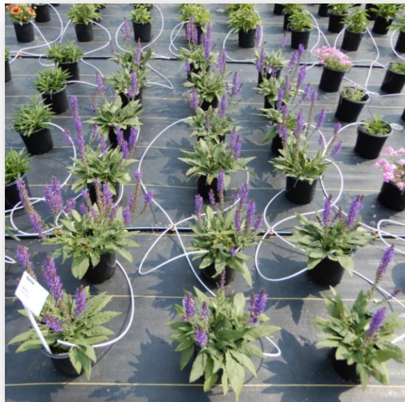
Group 1 Planted: wk 11 Photo: wk 22 (5.31.19)