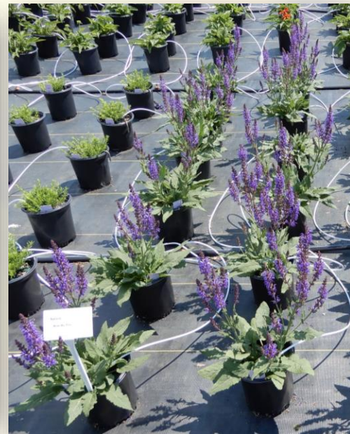
Group 3 Planted: wk 20 Photo: wk 26 (6.28.19)