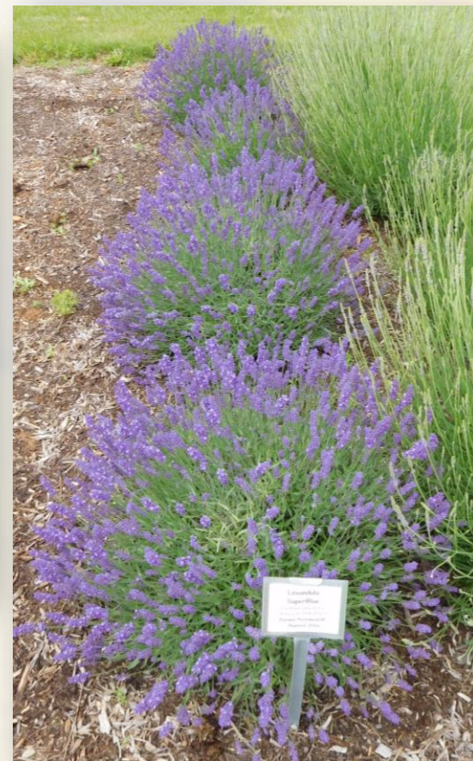
Overwintered in PA trials Photo: 6.7.17