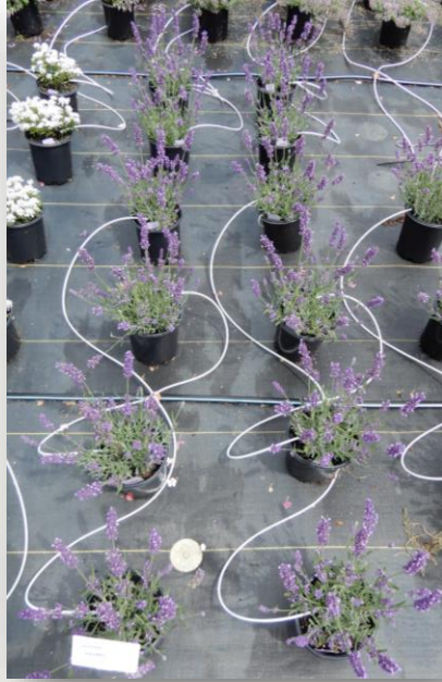
Group 3 Planted: wk 20 Photo: wk 29 (7.18.19)