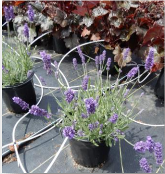
Group 1 Planted: wk 11 Photo: wk 23 (6.7.19)