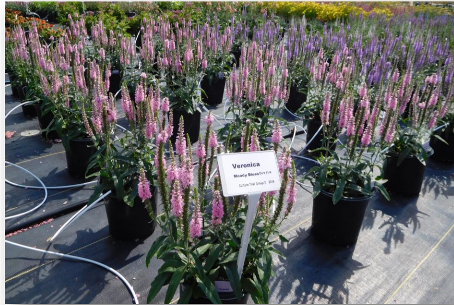
Dark Pink Photo: wk 28