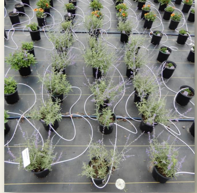
Group 5 Planted: wk 28 Photo: wk 37 (9.13.19)