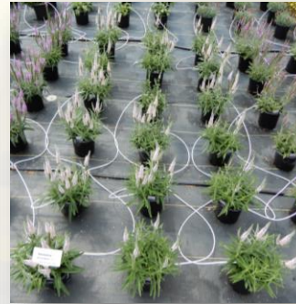
Pink Photo: wk 29