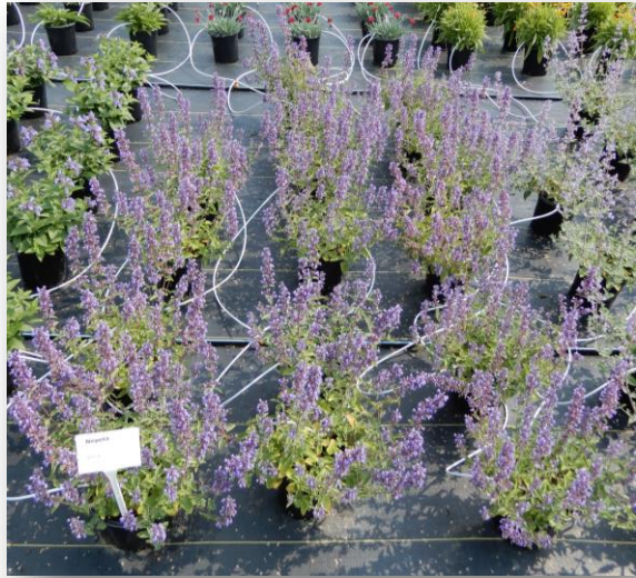
Group 1 Planted: wk 11 Photo: wk 22 (5.31.19)