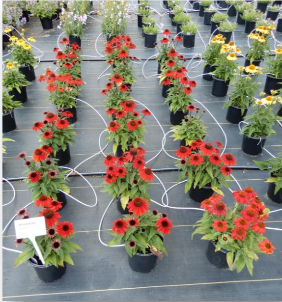
Group 1 Planted: wk 11 Photo: wk 26 (6.28.19)